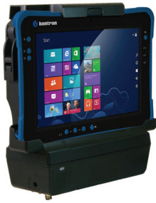
// VEHICLE DOCK