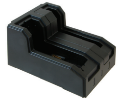
// 2-BAY BATTERY CHARGER