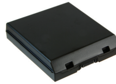
// LONG LIFE BATTERY PACK