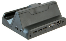
// DESKTOP DOCK