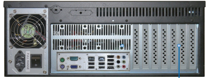
7x PCI slots attribute to network expansion and scalability