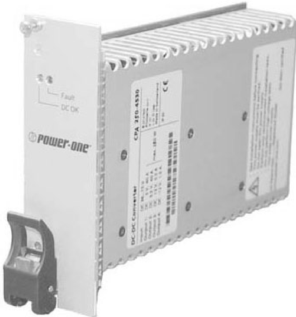
Figure 1: View of Power Supply Unit CP3-SVE-P200AC