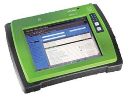
Figure 2 With the help of Kontron MARS, mobile applications - such as the diagnostic system for automobiles shown here can be supplied with an uninterrupted flow of power: A fall back battery allows to replace the discharged battery without intermission.

or a signal when the battery needs to be replaced or the device should be docked on the charger.